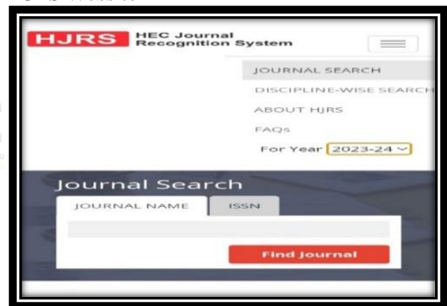
HEC Journals Recognition System (HJRS) HJRS Website