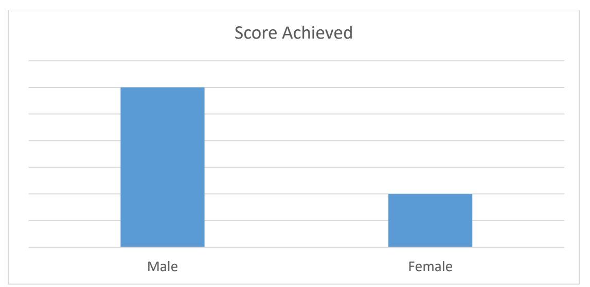
Fig. 2: Graphical representation of Child Protection Mechanism in Male and Female Institutions