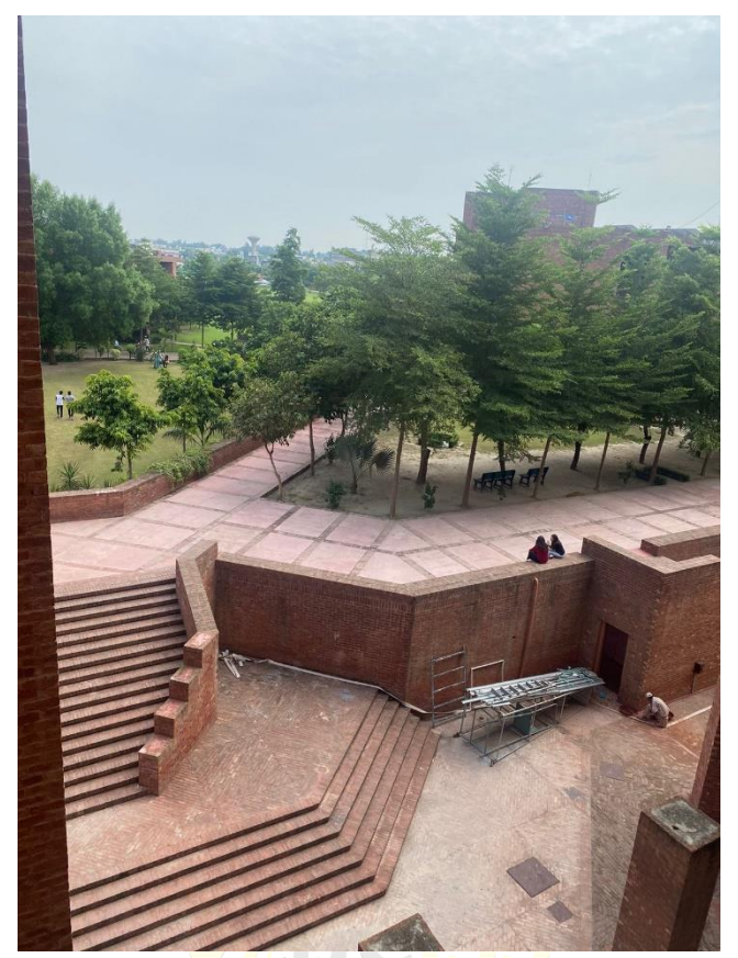
Figure 6 Outdoor Sitting Area