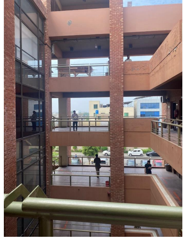
Figure 5 Views of Corridors