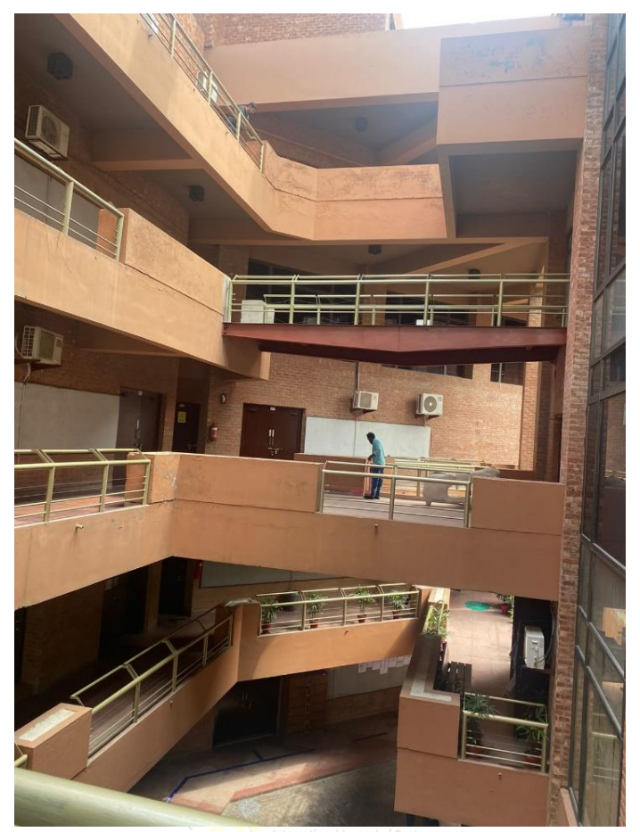
Figure 3 Courtyard View from Passageways