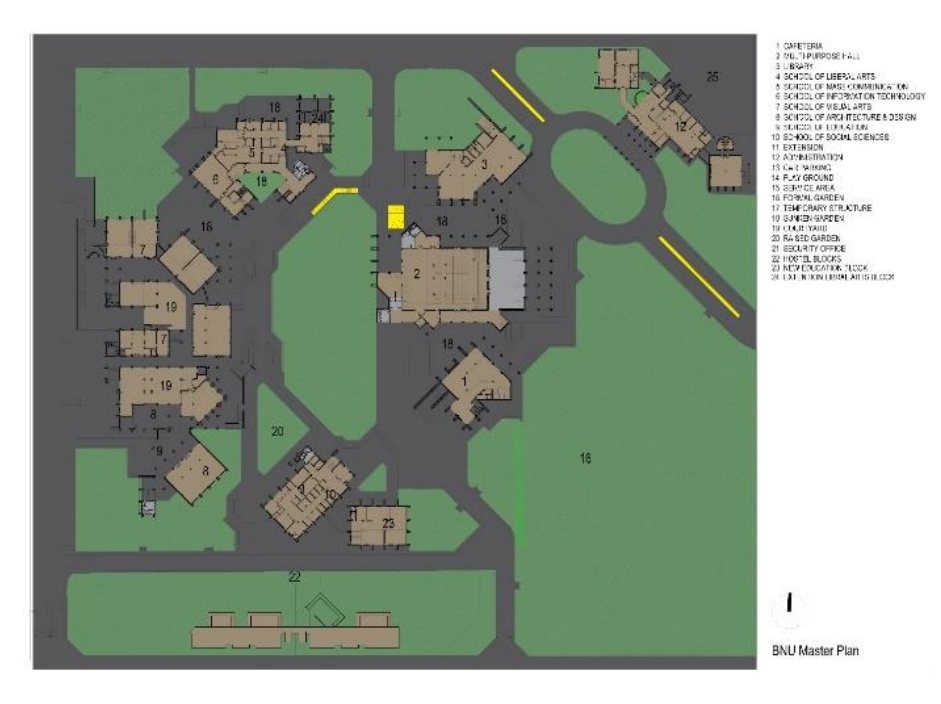
Figure 1 Masterplan of Beaconhouse National University