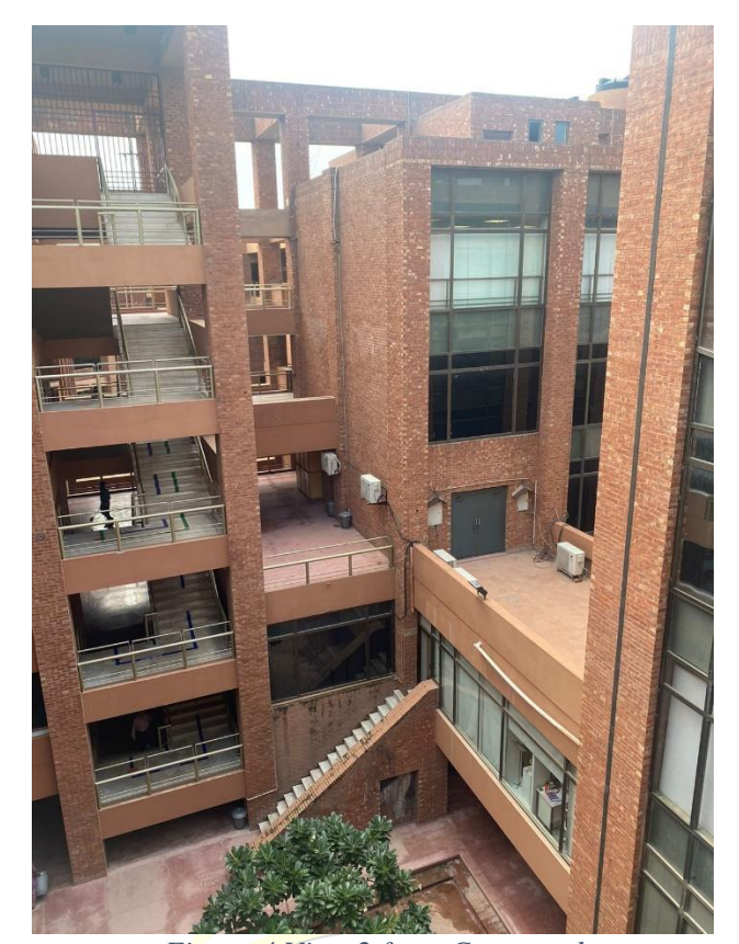
Figure 4 View 2 from Courtyard