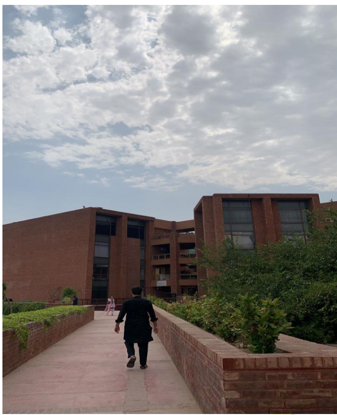
Figure 2 Back Entrance of Building