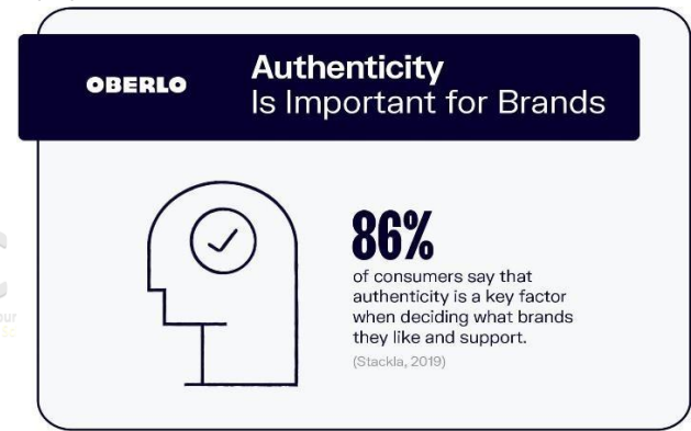
Figure 1 Importance of Brand authenticity

Figure 1 above signifies that 86% consumers in the survey responded they consider brand authenticity while making purchasing decisions and the recent survey posted in Oberlo stated that 81% of the consumers buy based on trust.