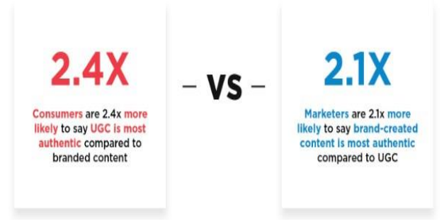
Figure 2 Role played by online content in creating brand authenticity

This depict the social media has the power and plays massive role in building brand authenticity of the manufacturing companies. Similar results can be seen in the case of Pakistani manufacturing firms, where it was argued by Riaz and Ahmed, (2019) that the rising number of fast food companies has augmented the penetrating competition in fast food manufacturing. The researcher further articulated the results which signifies a positive and significant association amid brand authenticity and social media marketing. Research findings likewise illustrates that social media marketing as important constituent in managing and constructing brand authenticity in fast food sector of Pakistan. It also supports the arguments of Objects, (2022) where the researcher contended that social media marketing assists fast food brands to construct an appealing association with the clients and increases optimistic perception towards brand or company.