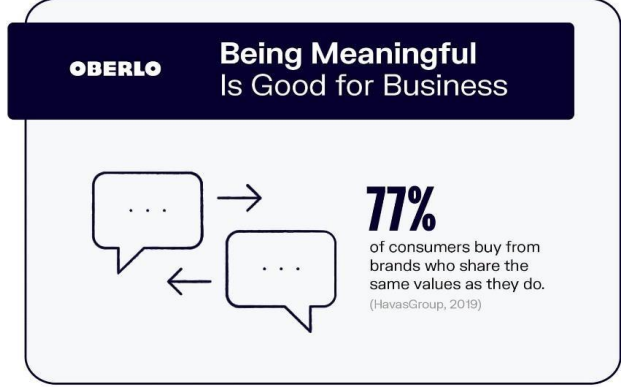
Figure 4 Increasing value to enhance brand authenticity

On the other hand, the results also signifies that, being meaningful is important for the business and this can be done by using social media as depicted in figure 4 below.