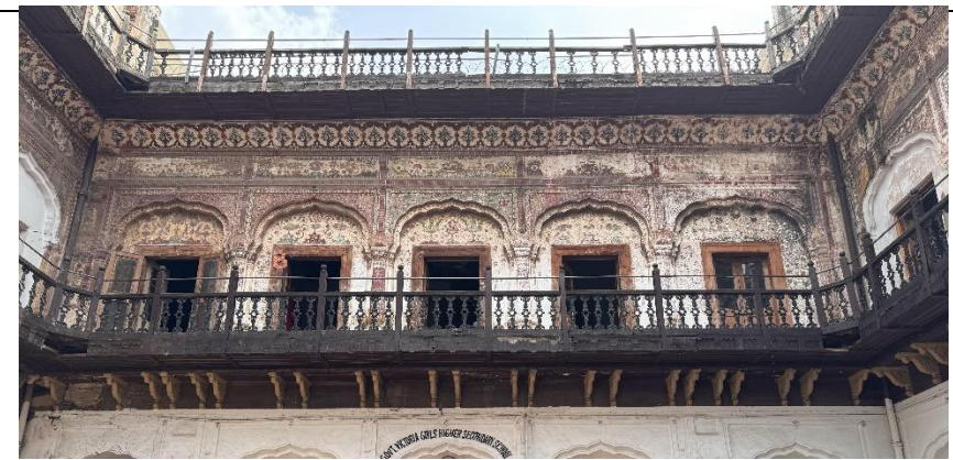
Figure-10. Interior courtyard details of Nau Nehal Singh's Havelī, Lahore.