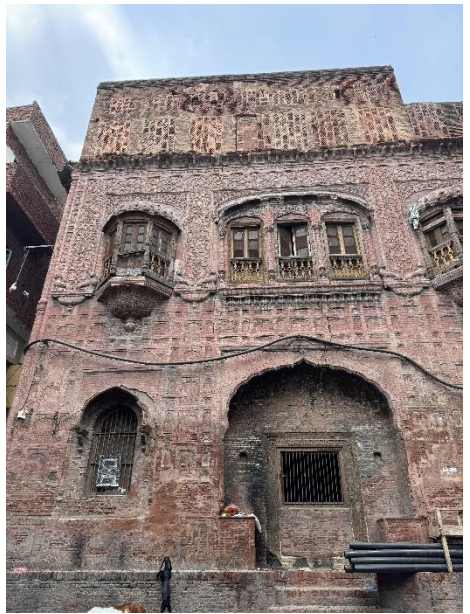
Figure-6. Back side elevation of Nau Nehal Singh's Havelī, Lahore.

relief work, they are positioned between the side jharokas and central large window.