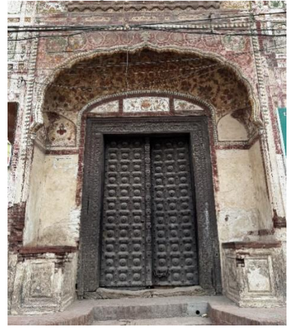
Figure. 5. Carved wooden door of Nau Nehal Singh's Havelī, facade, Lahore. Situated at recessed arch type niche with a cusped arch, the entrance's original carved wooden doorframe is now partially blocked by brick, preventing entry from the west side. There are carvings made of cord and leaves on this arch, and a flower sits at the top. These elements, which serve as seats for guards or doorkeepers, are essential to the subcontinent's magnificent entryway. The recessed recesses on either side of this arched entryway are now adorned with pointed hood-molds.

The second level of frontal façade is simpler as compare to others, low relief arches that set windows along with miniature columns depict the Sikh era. The wall is bifurcated in rectangular