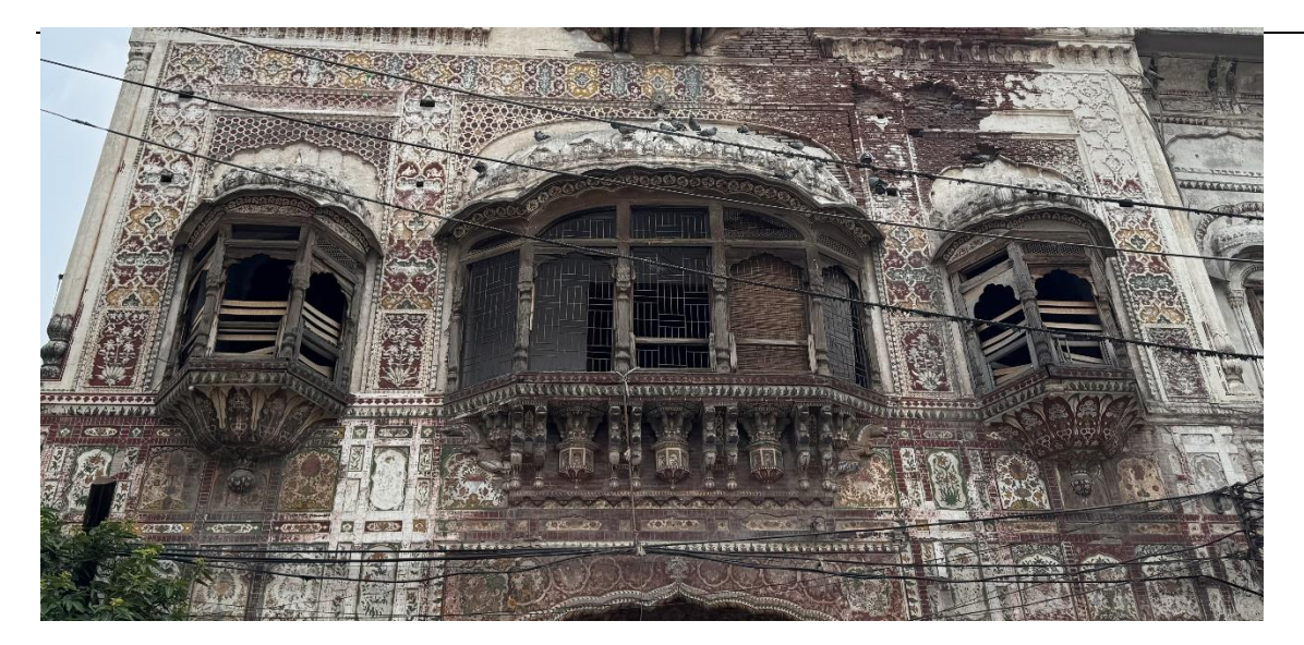
Figure. 4. Perforated Jharoka in Nau Nehal Singh's Havelī, facade, Lahore.