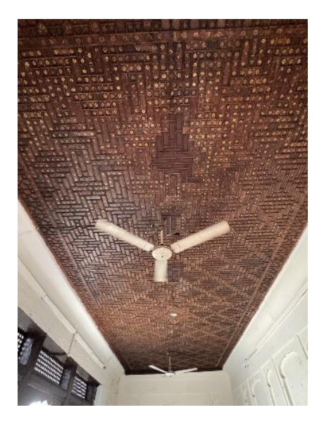
Figure-7 wooden ceiling with mirror in the center

elements to show the grandeur and power of the rulers. Third and Fourth storey rooms of Nau Nehal Singh's Havelī were still found to have the original woodwork with geometrical patterns (Figure 7 and 8). All the openings of these rooms are fitted with Perforated Jali work that allow light to get in, keeping the privacy maintained.