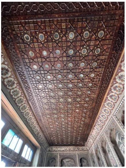
Figure-8 wooden ceiling with mirror work

Paintings and Frescoes: The Frescoes and paintings were also found abundantly in highly decorative interiors and exteriors in Sikh Haveli's. The colorful interplay of design, forms, colors were used for depiction of historical events, religious articulations as well as everyday life portraits. These artistic compositions displays the cultural traditions as well as significant values attached.