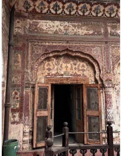
Figure-11. Fresco work details in central courtyard of Nau Nehal Singh's Havelī, Lahore.

Decorative Tile-work: Sikh haveli's also extensively decorated with the ceramic tilework with beautiful colored patterns. The tilework was