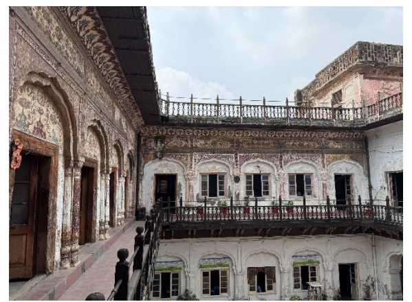
Figure-9. Central courtyard of Nau Nehal Singh's Havelī, Lahore.

Nau Nehal Singh's Havelī, Lahore consist over 40 rooms, its main feature is the huge central courtyard with adorned interior intricate details of frescos in the courtyard walls. The original ornamentation of Sikh time period can be seen at the two main elevations of interior of courtyard as shown in the figures 9,10 and 11.