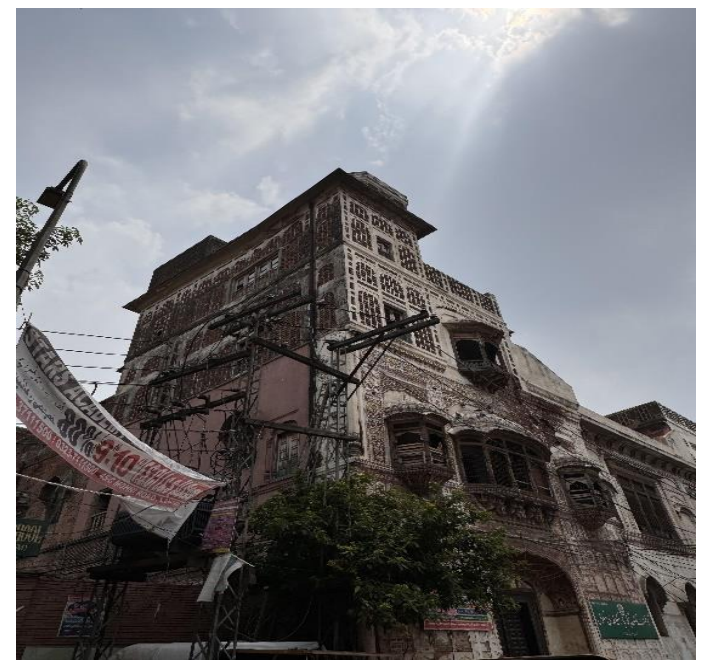
Figure-2 Western Façade of Nau Nehal Singh Haveli.

The plan of the Haveli was found to be rectangular with segmented facades and well decorated main entrance (Figure-2). This is masterpiece of Sikh era considered as architecture that showcases the delicate Stylized sculpture along with fresco work on both eastern and western facade of Haveli. On eastern side, the brickwork that is carved with different ornaments and relief work are significant for multiple They reciprocate the range of reasons. craftmanship activities during Sikh era in Lahore along with flaunting the magnificence and power of this art piece.