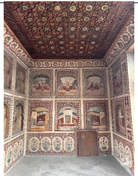
Figure-12. Decorative tilework of Nau Nehal Singh's Havelī, Lahore.

Marble Jali and Inlay Work: The most striking feature of these Haveli's is the marble inlay work with vibrant colors embedding stones. The intricate design and detailing were the key features that creates the interlocking to create the harmoniously knitted surfaces. Mostly the